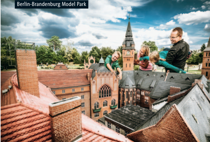
Berlin-Brandenburg Model Park

The FEZ Berlin (29) in the spreading Wuhlheide Park covers a vast 113,000 sq. metres. The leisure centre has everything kids love, with a bathing lake and lawns for summer, as well as playgrounds, basketball court and kickabout areas, the Eco Island, and a climbing tower. If skies are grey, families can visit the Alice Museum for Children, take in a show at the Astrid Lindgren Stage, or visit the indoor playgrounds. fez-berlin.de