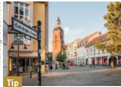
St. Nicholas' Church

Spandau is rich in contrasts – a treasure trove of history and a modern industrial location, a water sports paradise and a leafy landscape with romantic corners!