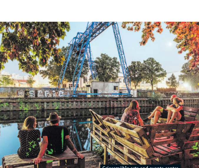
Griessmühle arts and events centre

To commune with nature, Berliners head for the Schloss Britz manor park, the spreading Britzer Garten park or take a stroll through the Körner Park. At the nearby Richardplatz square, the 18th-century houses of the historic Bohemian settlement are well worth seeing.