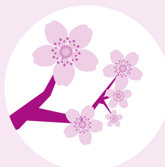
Cherry March – May