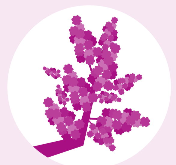
Lilac April – June