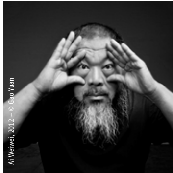
Ai Weiwei, 2012

Along the former course of the Wall; kulturprojekte-berlin.de