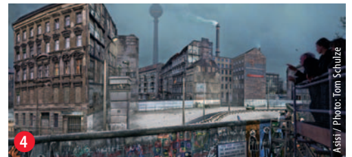
Asisi / Photo: Tom Schulze