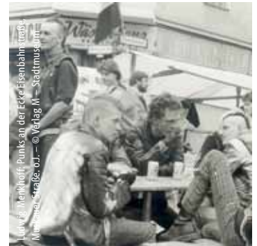
Leif W. Leifhoff, Punkt an der Ecke Eisenbahntrasse, Museumstraße, 01 – © Verlag M – Stadtmuseum

Location: Deutsches Historisches Museum, Unter den Linden 2, Berlin-Mitte daily 10a.m.–6p.m.; dhm.de